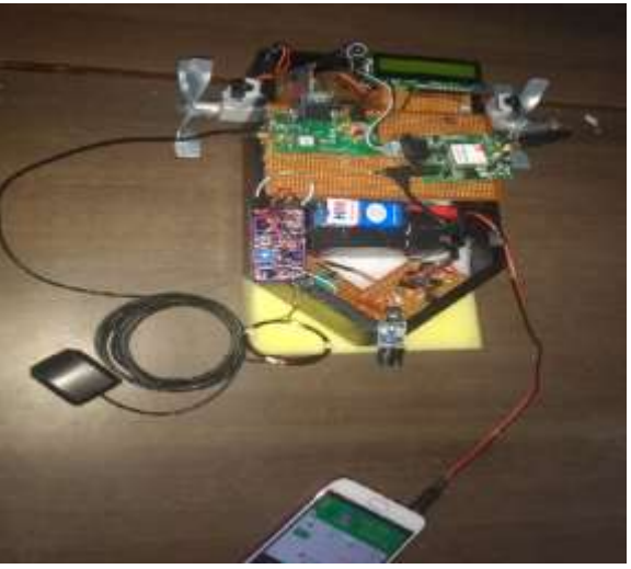
The prototype model of the sailing boat